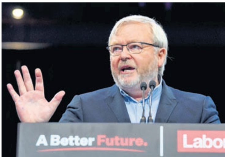
Former Australian Prime Minister Kevin Rudd gestures at a Labor Party rally during the federal election campaign in Brisbane, Australia on May 15, 2022.

He has lived in the U.S. for most of the past decade, working first at the Harvard Kennedy School researching U.S.-China relations, followed by eight years in various roles at the Asia Society. “In some ways, my new position will not be dissimilar to the work I have been undertaking at Asia Society to support greater cooperation between the U.S. and the countries of our region experience which should hold me in good stead for the challenge ahead,” Rudd said in his statement. □